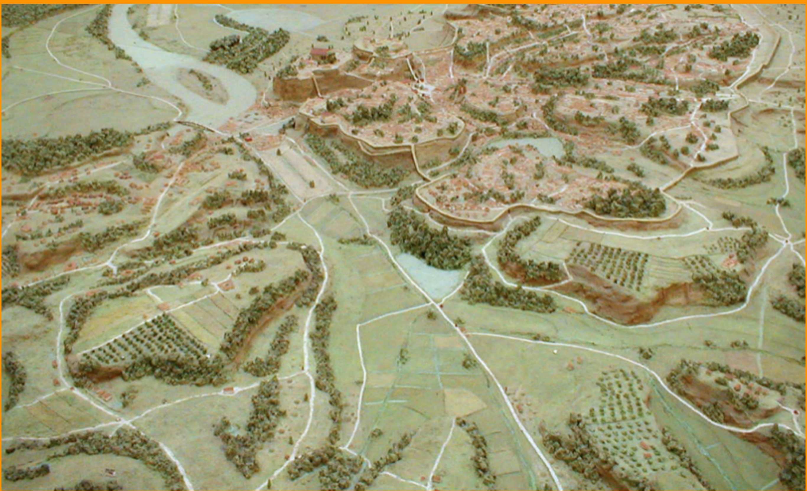
Rome c.509 BC