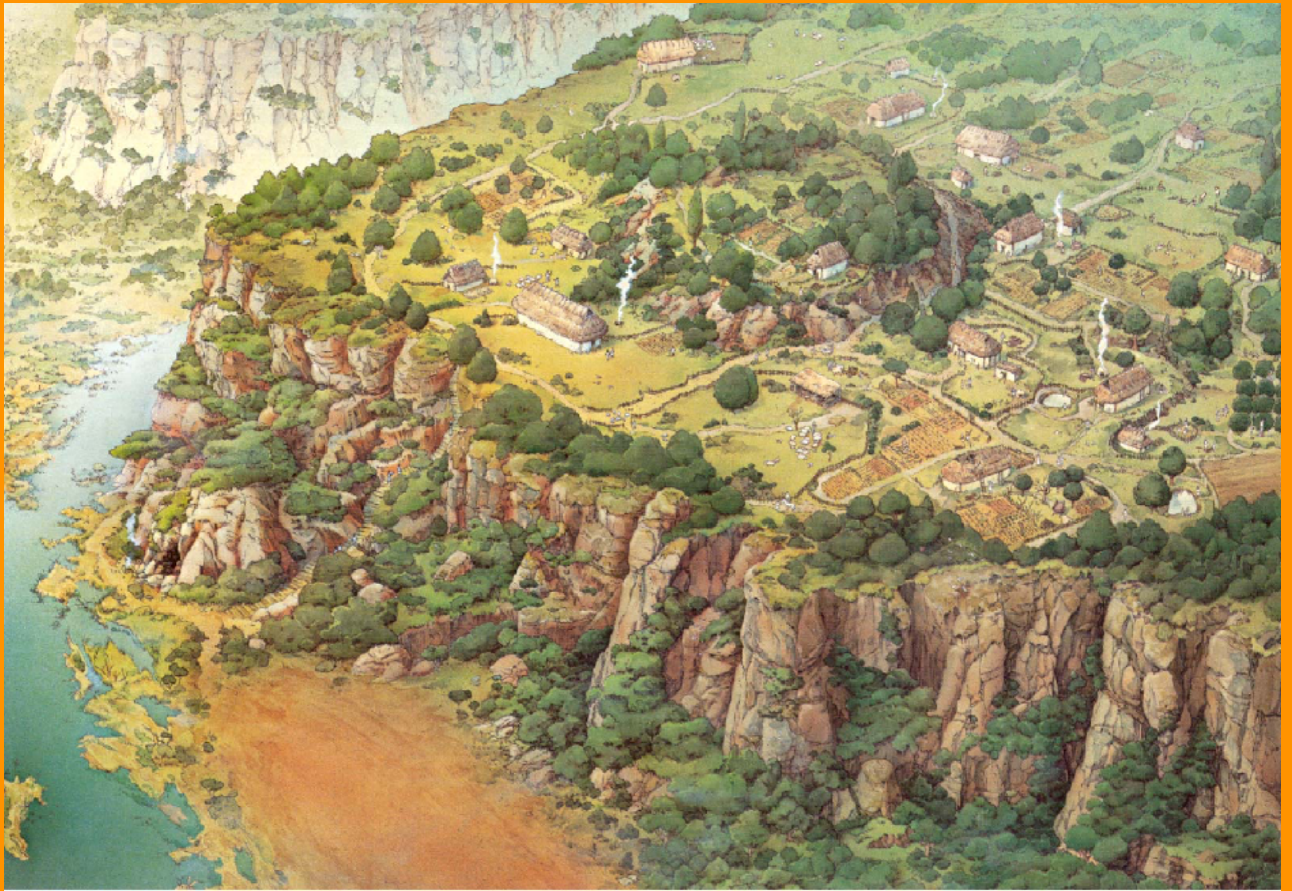
Rome c.753 BC